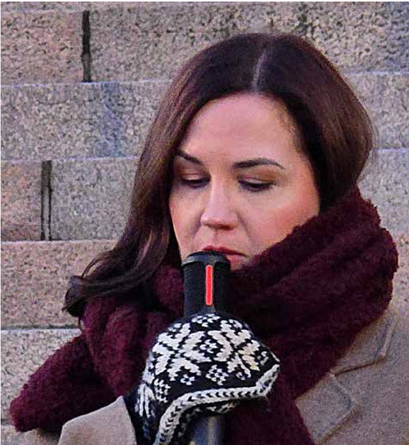
Minister Sanni Grahn-Laasonen speaking at a memorial service for victims of intimate partner violence on Tuesday in Helsinki.