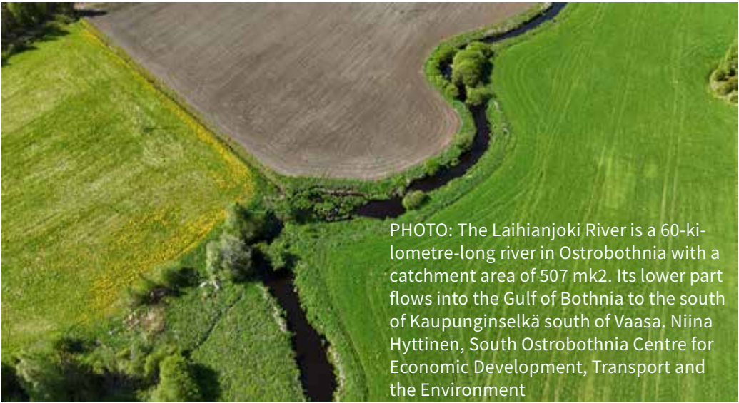
PHOTO: The Laihianjoki River is a 60-kilometre-long river in Ostrobothnia with a catchment area of 507 mk2. Its lower part flows into the Gulf of Bothnia to the south of Kaupunginselkä south of Vaasa. Niina Hyttinen, South Ostrobothnia Centre for Economic Development, Transport and the Environment

Finland’s waterways will receive a historic investment – the nearly EUR 28 million ACWA LIFE project will start in January 2026 and improve the status of waters over eight years. The project brings together landowners, organisations, researchers and authorities to develop water management in five model areas, including the Laihia River.